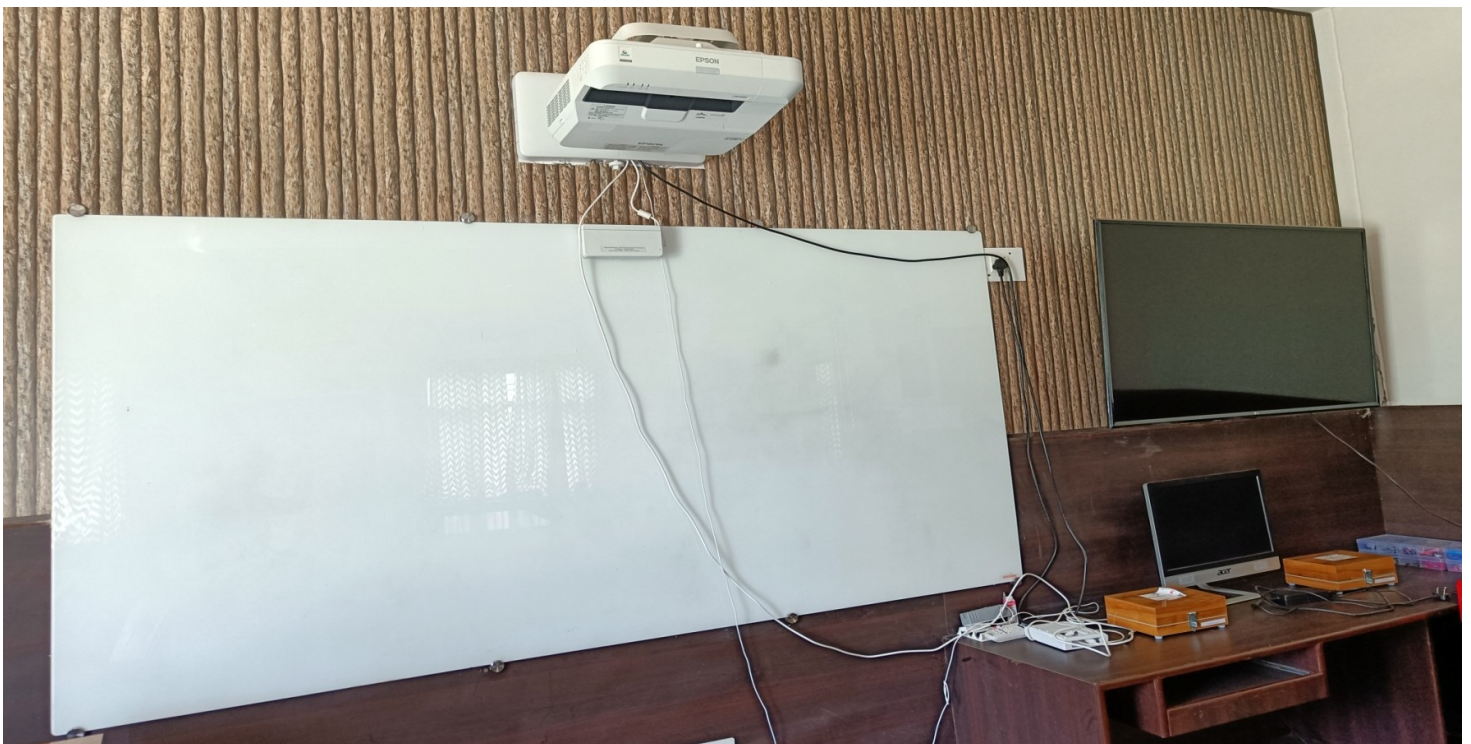
Smart Class Room